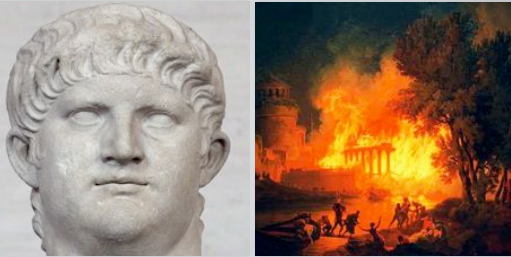
Emperor Nero: 37-68 AD